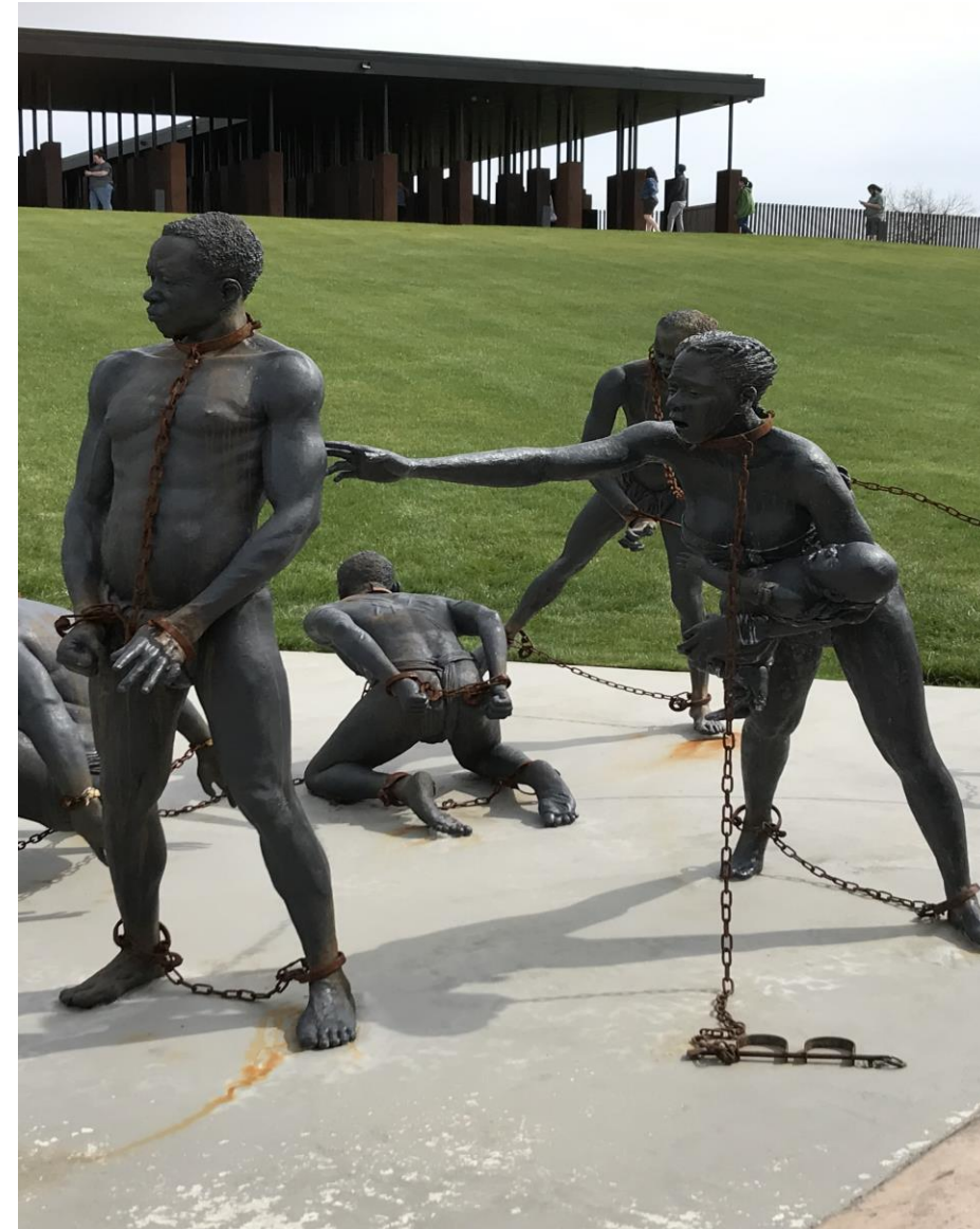
Representation of the slave market: the Peace & Justice Memorial in Montgomery Alabama

(Article I, Section 2 of The Constitution of the United States of America)