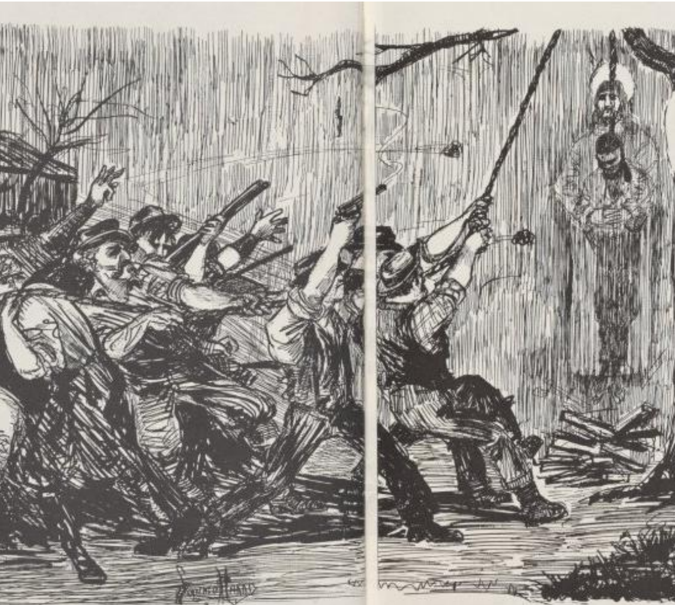
CHRISTMAS IN GEORGIA A. D., 1916

In The Crisis , December, 1916. The NAACP's magazine, edited by W.E.B. DuBois.